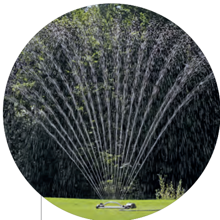
WIDE-REACHING, UNIFORM JET LIKE LIGHT RAIN

The Compact line is the ideal choice for watering your lawn, as it has an adjustable jet that simulates light rain. The elegant design of the outer casing in ABS, a sturdy turbine engine and resistant gears make this line one of Claber's most successful. Thanks to the special Aqua Control system, it could not be any easier to adjust the coverage of the area you want to water with just 2 fingers!