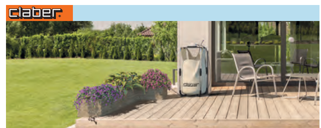
PUB0092010000 UNDERGROUND INFORMATIVE PANEL