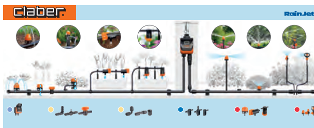
PUB0092030000 DRIP PANEL