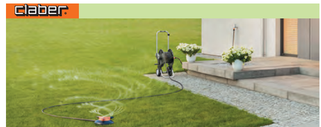
PUB0092000000 DRIP INFORMATIVE PANEL