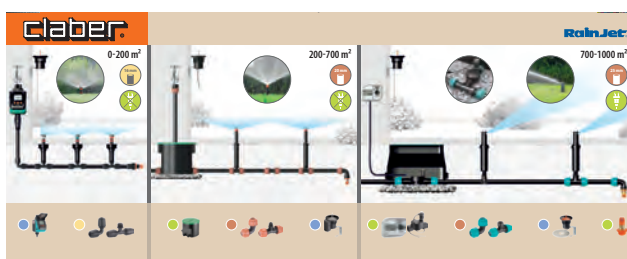
PUB0092040000 UNDERGROUND PANEL