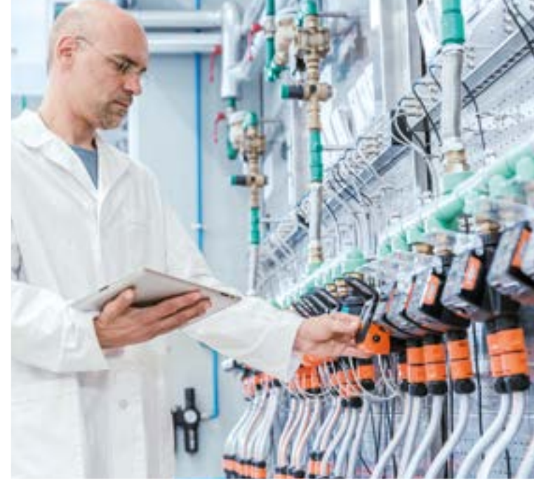
THE LAB'S WORK STATIONS ARE INTER-CONNECTED TO ANALYSE LARGE FLOWS OF DATA.

IN THE LAB, PRODUCTS AND PROTOTYPES ARE SUBJECTED TO EXTREME CONDITIONS TO TEST THEIR EFFICIENCY AND RESISTANCE.